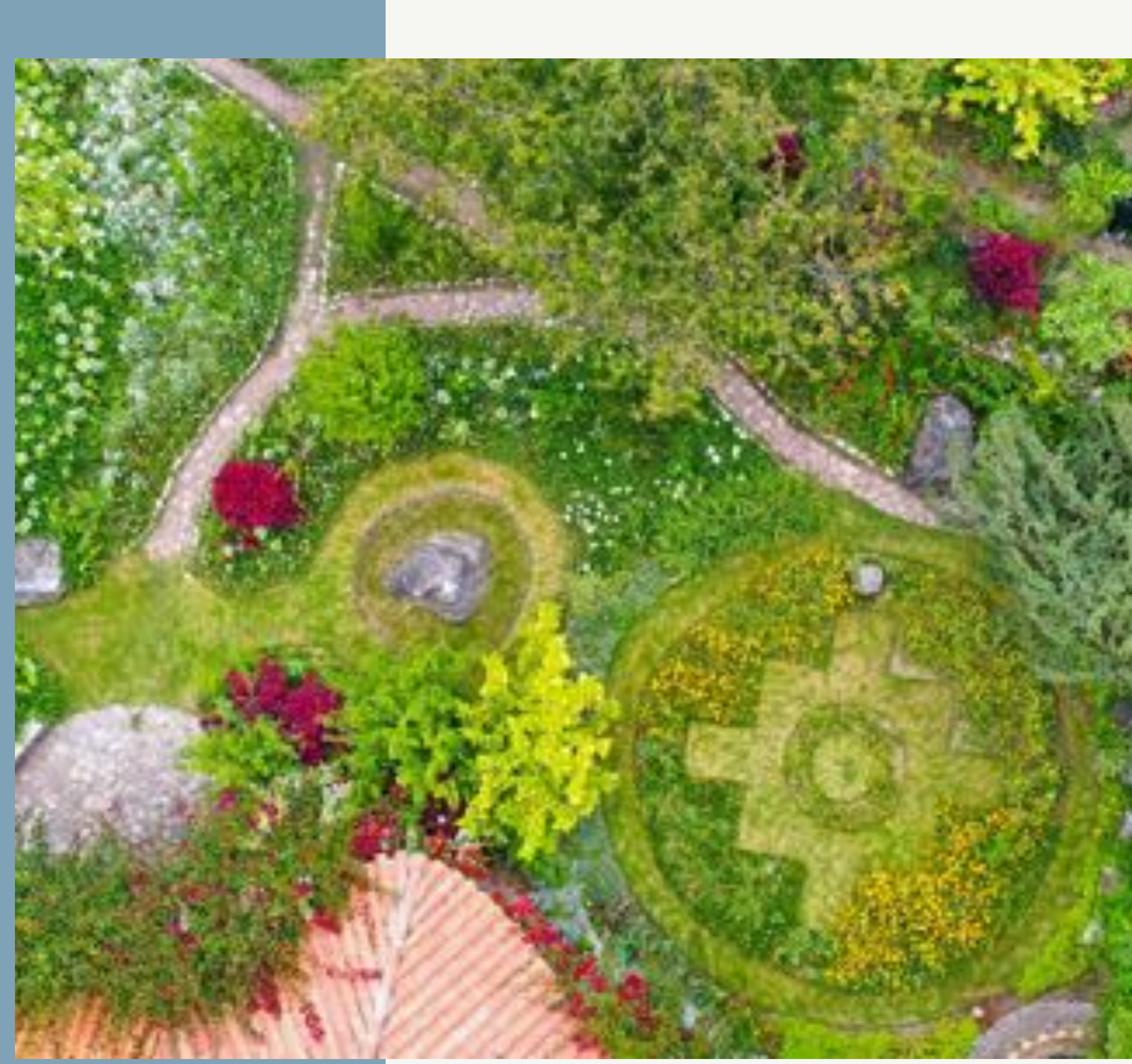
Note: Schedule subject to change based on availability